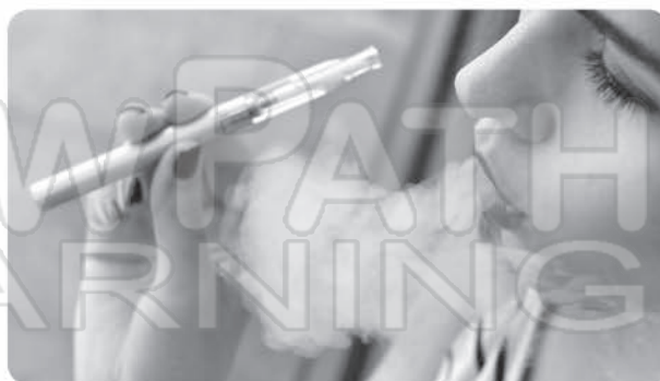
E-cigarettes contain nicotine & other harmful chemicals.